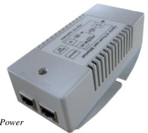
TP-POE-HP High Power