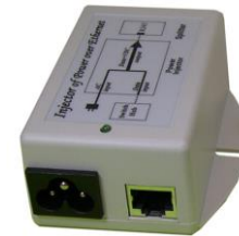
TP-POE Medium Power